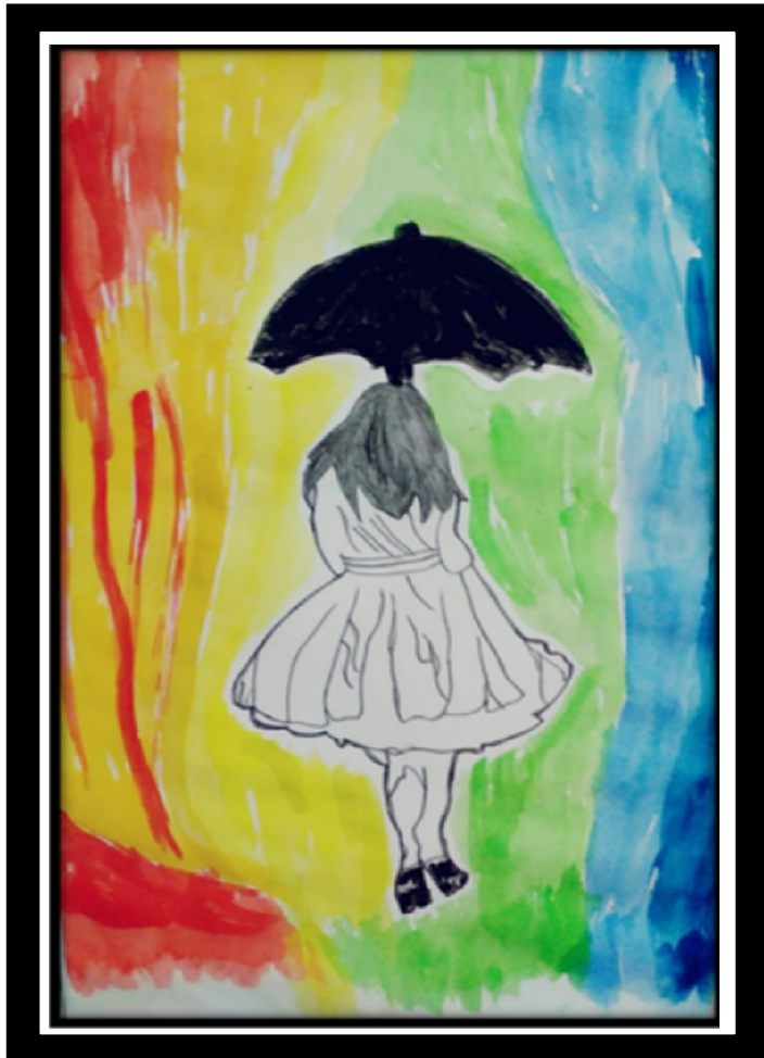
Janani .N (III ECE)