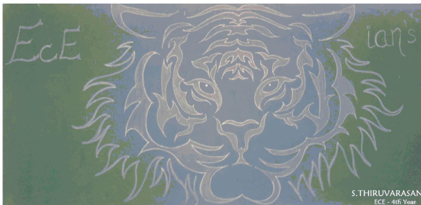
Thiruvarasan .S (IV ECE)