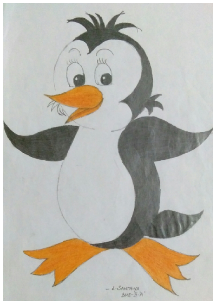
L Santhiya (III A BME)