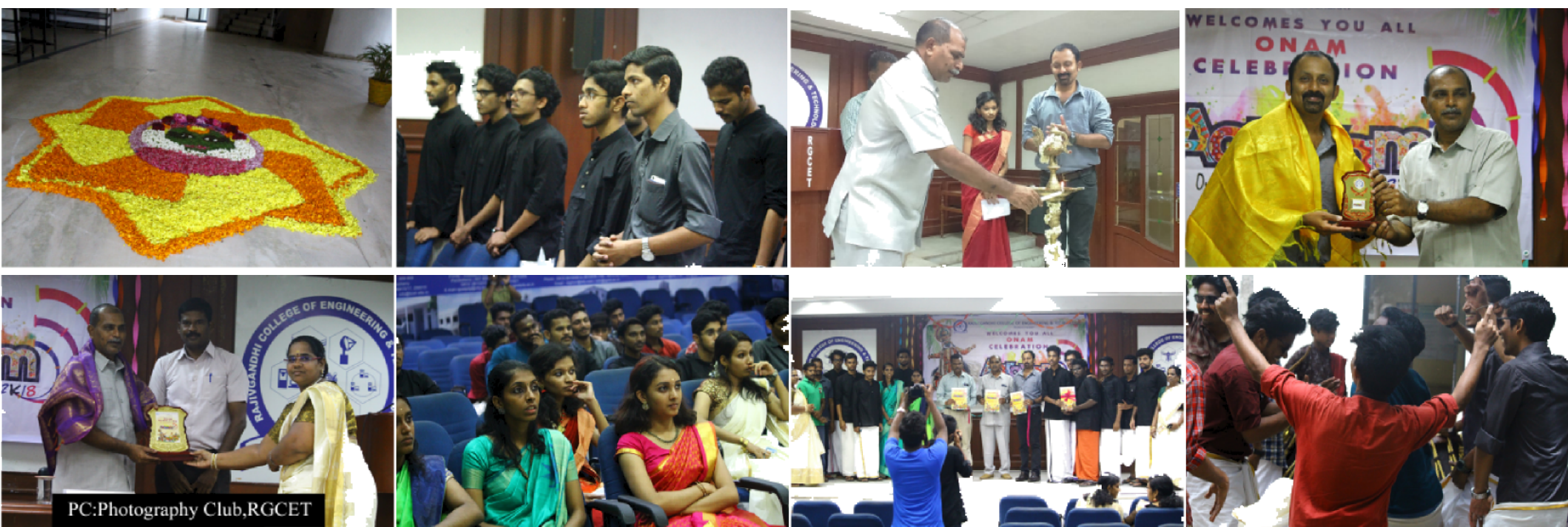
(From Top Left) Pookalam, Students rising-up for prayer song, Lighting-up the lamp, Honoring Chief Guest, Principal is honored by event coordinators Students enjoying cultural Programs on Stage, Releasing Onam Souvenir Student dancing to 'Shingari Melam'